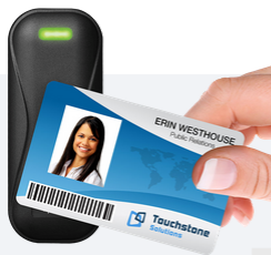
Employee Badge Reader