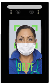
Thermal Temperature Screen