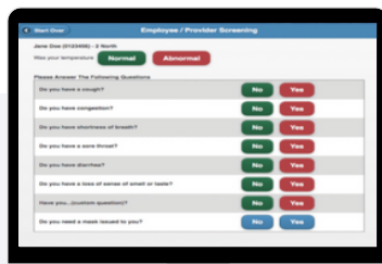
Wellness Symptom Check