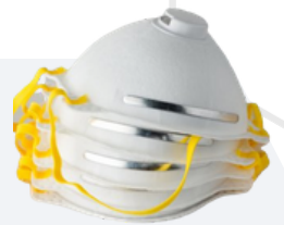
Mask Distribution & Tracker