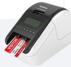
Visitor/Patient Badge Printer