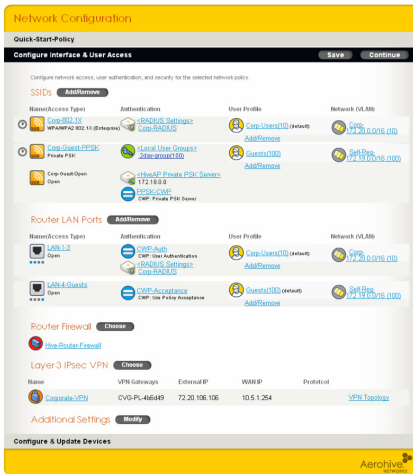
Guided configuration of unified wired and wireless Network Policies.

HiveManager Online 5.0 is an enterprise-class NMS for Aerohive access points and branch routers.