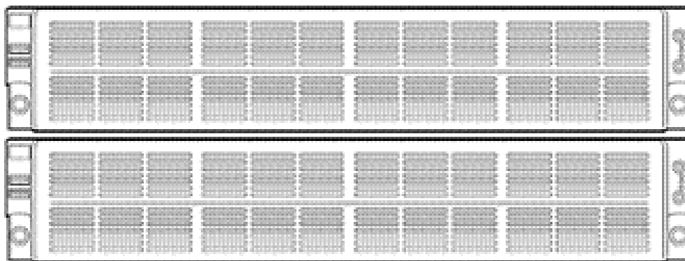
HP LeftHand P4000 SANs

The P4000 SANs are bundle configurations that provide High Availability, Scalable Performance and Enterprise Features for any budget. Each P4000 SAN includes hardware, software, and 3yrs support to get you up and running in one swift motion.