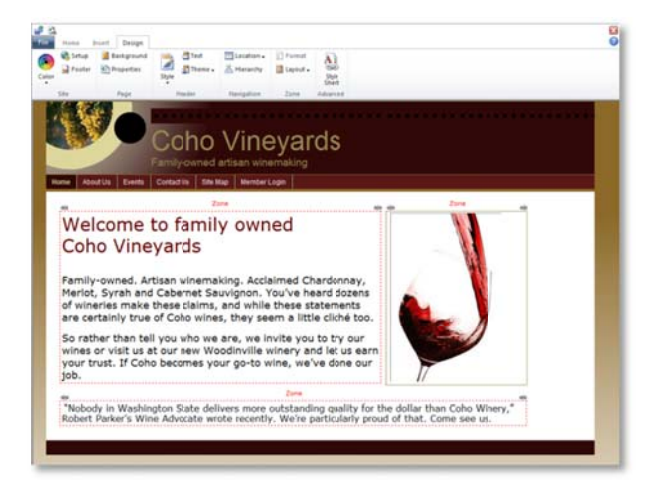
Easy-to-use web-based design tools