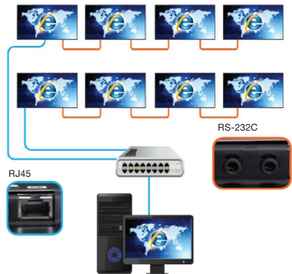
Figure 4. Samsung ME75C LED displays enable RJ45 and RS-232 connectivity simultaneously.

Samsung ME75C LED displays offer powerful connectivity, even when working with RJ45 and RS-232 connections. Competitor displays can operate only an RJ45 or RS-232 connection. With the Samsung line of LED displays, both network connections can be used simultaneously. Using a DP 1.2 loop out, a single display image can be shared with nearby displays. This feature eliminates the need to purchase separate video signal distributors for each display, further reducing equipment costs.