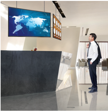
Figure 2. Samsung MagicInfo™ S all-in-one display solution includes an internal media player and signage software.

Three PIM options are available to suit specific needs.