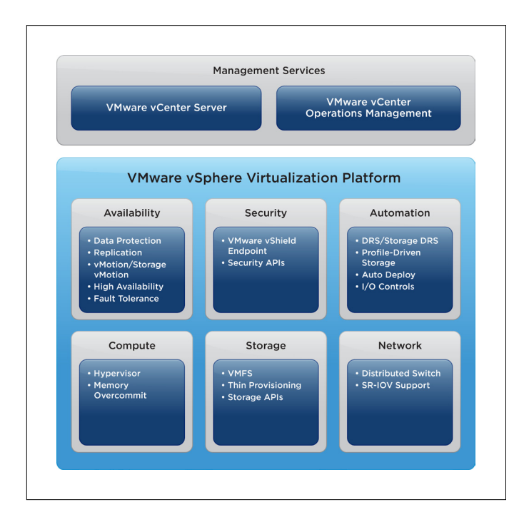
vSphere with Operations Management combines the world's leading virtualization platform with best-in-class management capabilities.