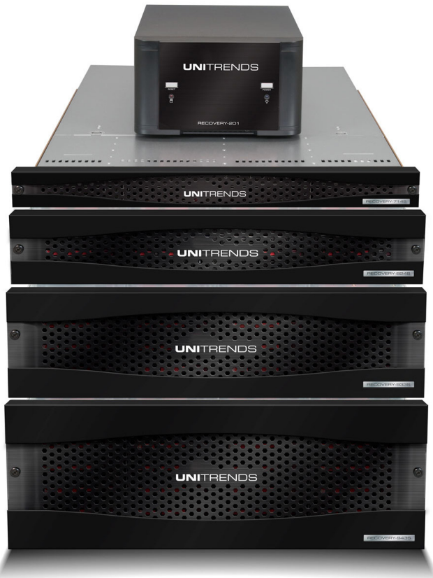
Unitrends Recovery Series Appliance Family

Today's modern backup and recovery solutions must be as agile and elastic as the IT environment they protect. Organizations face unrelenting data growth, increased server virtualization, and new silos of high performance physical server applications. Meanwhile, the fast pace of business demands aggressive Recovery Point Objectives (RPO), Recovery Time Objectives (RTO) and Service Level Agreements (SLAs). Unitrends Recovery Series appliances are purpose-built to meet these challenges.