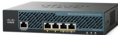
Figure 1. Cisco 2500 Series Wireless Controller

As a component of the Cisco Unified Wireless Network , this controller delivers centralized security policies, wireless intrusion prevention system (wIPS) capabilities, award-winning RF management, and quality of service (QoS) for voice and video. Delivering 802.11ac performance and scalability, the Cisco 2500 Series provides low total cost of ownership and flexibility to scale as network requirements grow.