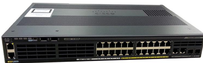
Figure 4. Fanless Quiet Cool 24-Port PoE Switch

The Cisco Catalyst 2960-X Series adds a new member to its 2960-X family, the WS-C2960X-24PSQ-L (Cool). This is a 24-port 10M/100M/1000M switch that can power up to 8 ports of PoE (first eight ports only) with ability to deliver a sum total of 110W of PoE power. This switch has four Gigabit Ethernet uplinks: two of them SFP and the other two 10M/100M/1000M copper interfaces enabling choice of fiber or copper connectivity to the aggregation point. This switch ships with the Cisco IOS LAN Base image.