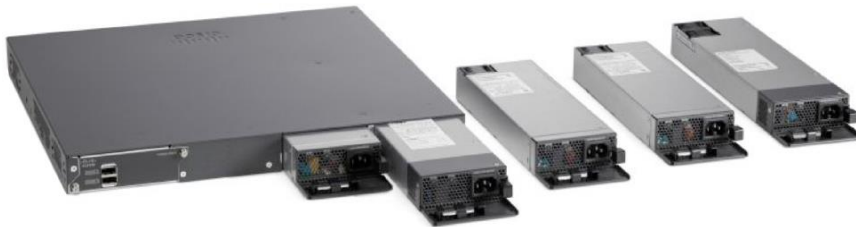
Figure 3. 2960-XR Family Power Supply

The following table shows the different power supplies available in these switches and the available PoE power.