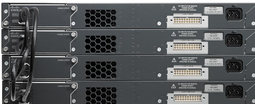
Figure 2. Cisco FlexStack-Plus Switch Stack