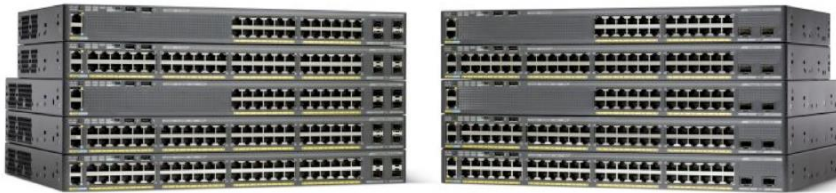
Figure 1. A Cisco Catalyst 2960-X Series Switch Family

Cisco® Catalyst® 2960-X Series Switches are fixed-configuration, stackable Gigabit Ethernet switches that provide enterprise-class access for campus and branch applications (Figure 1). Designed for operational simplicity to lower total cost of ownership, they enable scalable, secure and energy-efficient business operations with intelligent services and a range of advanced Cisco IOS® Software features.